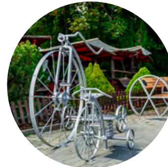
THE „TIME MACHINE” EXHIBITION

Tickets for the oldest funicular in Poland can also be bought online at www.pkl.pl