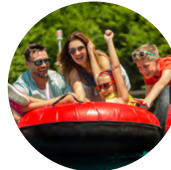
PARADISE SLIDES AND PONTOON SLIDE

A photo-booth carriage, music bench, 1930s bicycles (available at the upper ca-bleway station) will take you to Krynica from the time when the first wagon was reaching the top of Góra Parkowa.